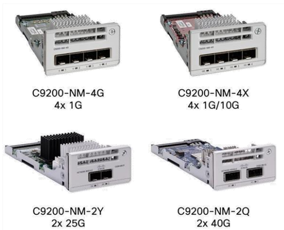
Figure 2. Cisco Catalyst 9200 Series Switch network modules

Cisco Catalyst 9200 Series switches come with modular or fixed uplinks as indicated in Table 1. With modular SKUs, the field-replaceable network modules provide infrastructure investment protection by allowing a nondisruptive migration from 1G to 10G and beyond. When you purchase the switch, you can choose from the network modules described in Table 3.