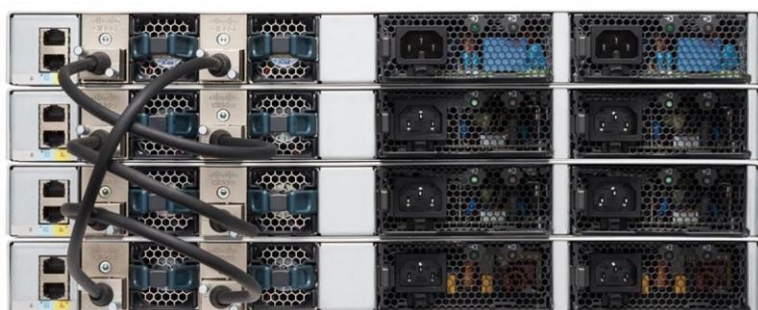
Figure 4. Cisco Catalyst 9200 Series Switch stacked units